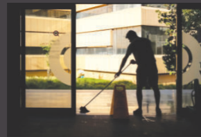
CLEANING & OTHER FM PROVISION