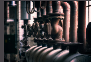
ESTATE & BUILDING MAINTENANCE