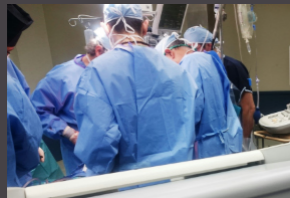
MEDICAL & ADMIN STAFF ACCESS